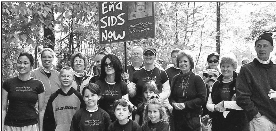
Family and friends from as far away as VA and PA came to join in the fun.